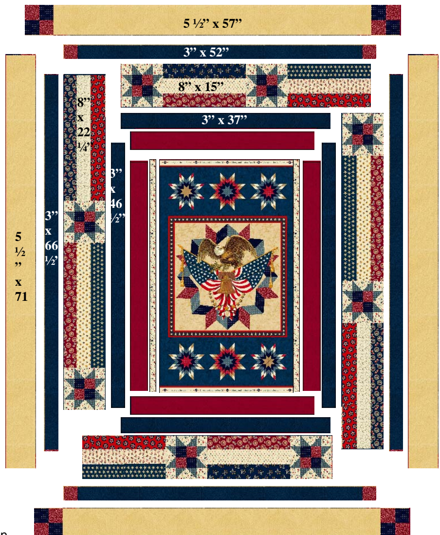
Quilt Assembly Diagram

14. Layer top, batting, and backing. Quilt as desired. Bind with the red texture fabric.